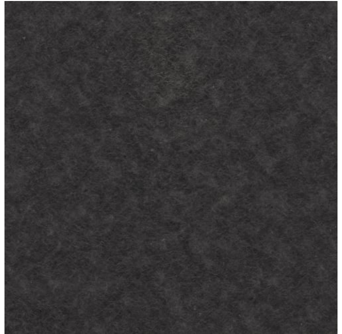
SLATE / ASH