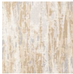
A176-567 BOHO CHIC