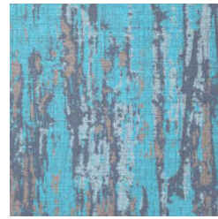
A176-329 TIDAL WAVE