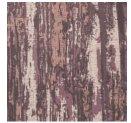
A176-333 ROCK STAR