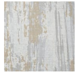
A176-852 STONE WASH