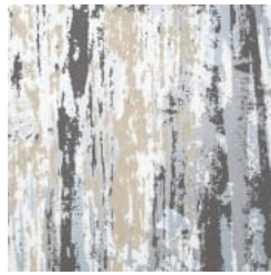
A176-054 DOWNTOWN MYLAR