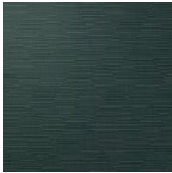
AVF13-270 HIDDEN COURTYARD