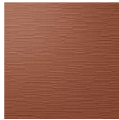
AVF13-543 ORIGAMI HOUSE