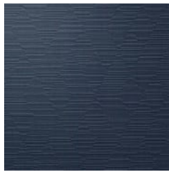
AVF13-392 LEATOP PLAZA