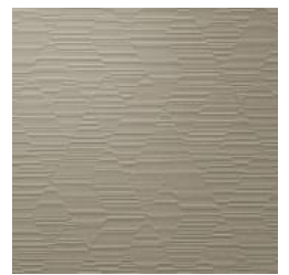
AVF13-829 SINO PARK