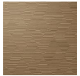
AVF13-622 CHICAGO SCHOOL