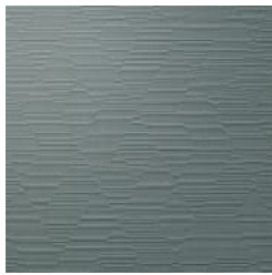
AVF13-359 FALLING WATER