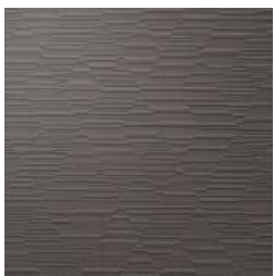
AVF13-874 TOWER VERRE