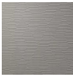
AVF13-815 STEEL FRAME