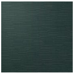
AVF13-270 HIDDEN COURTYARD