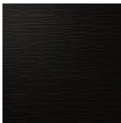
AVF13-898 SOLAR CARVE