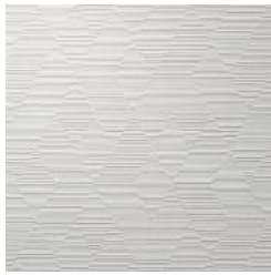
AVF13-005 TORRE DIAGONAL