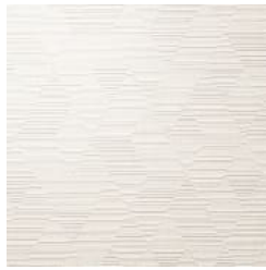
AVF13-012 KENITRA STATION