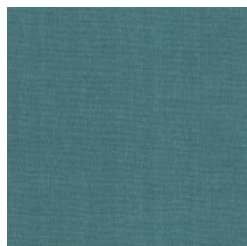
SN101012P WINTER DUSK