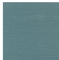
SN101008P BLUE- GREEN