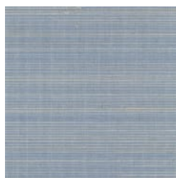
SN101003P WATER BLUE

Wallcoverings » Decorative Wallcoverings