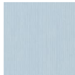
ST101002P ICE BLUE