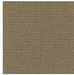
SN101050P AUTUMNAL TINTS