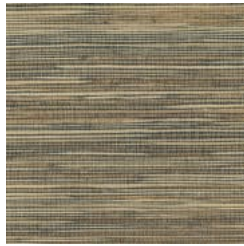
SN101055P BASQUE BROWN