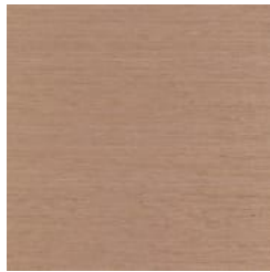
ST101057P NOAH BROWN