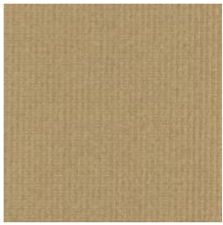
SN101046P HAVANA TOBACCO

Wallcoverings » Decorative Wallcoverings