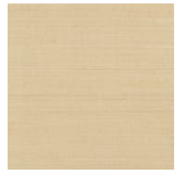
SN101120P SHALLOW EARTH