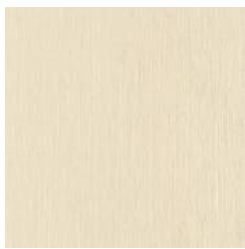
ST101112P CHAMPAGNE YELLOW