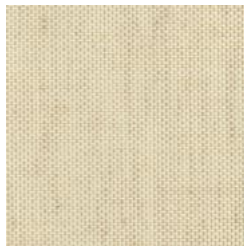
SN101116P PALE YELLOW