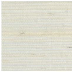
SN101020P CREAM- COLOURED

Wallcoverings » Decorative Wallcoverings