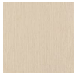
ST101118P SHALLOW DARK BROWN