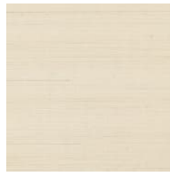
SN101119P PINK COLOR