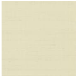
SN101107P IVORY TINT