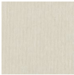
SN101115P SAND BEACH