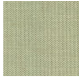
SN101043P LAGOON GREEN