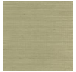
SN101035P AVOCADO GREEN