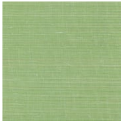
SN101038P APPLE GREEN