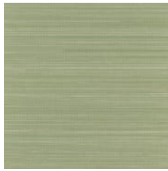
SN101033P OLIVE GREEN