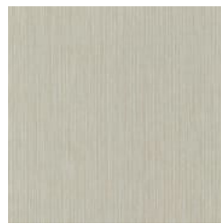
ST101041P SHALLOW BEAN