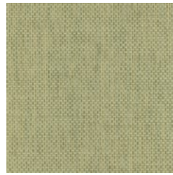
SN101034P WATER GRASS