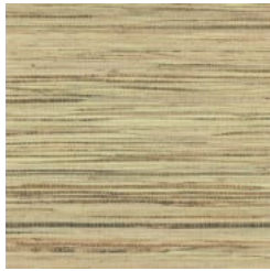
SN101037P LINDEN LEAF