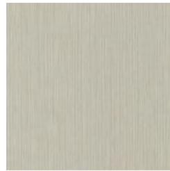
ST101041P SHALLOW BEAN