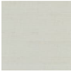
SN101029P FISH'S BELLY WHITE