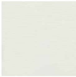
SN101019P TEA WHITE

Wallcoverings » Decorative Wallcoverings