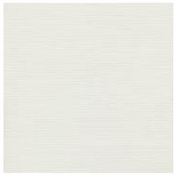
SN101019P TEA WHITE

Wallcoverings » Decorative Wallcoverings