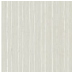
ST101024P YABO WHITE