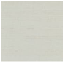
SN101029P FISH'S BELLY WHITE