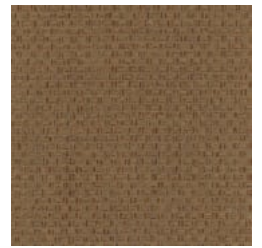
SN101180P COCONUT BROWN