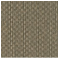
SN101175P MUHA COFFEE