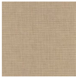
SN101176P YELLOW DEER