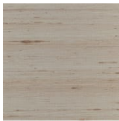
ST101177P ROE DEER