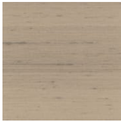
SN101168P KOALA BEAR

Wallcoverings » Decorative Wallcoverings