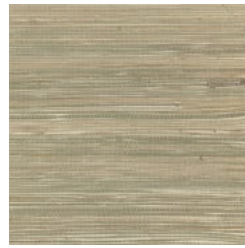
SN101171P HAVANA TOBACCO