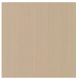
ST101167P KRAFT PAPER