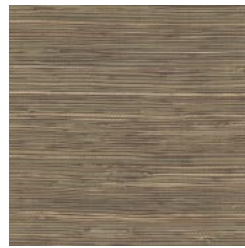
SN101179P MAROON HORSE