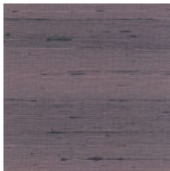
ST101145P CARBON PURPLE