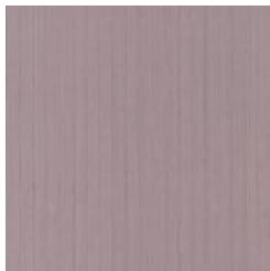
ST101144P STONE LOTUS