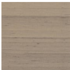
ST101068P GRAY MATTRESS