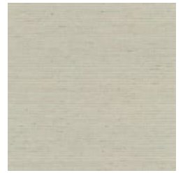
SN101071P PEBBLE COLOR