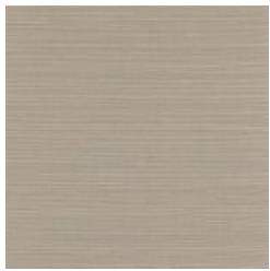
SN101072P CEMENT COLOR