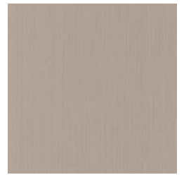
ST101065P MINERAL COLOR