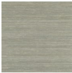
SN101074P MOLE COLOR