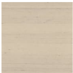
ST101066P CANVAS COLOUR