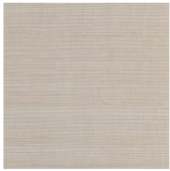
SN101064P BOG COLOR

Wallcoverings » Decorative Wallcoverings