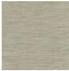
SN101069P DETRITUS COLOUR