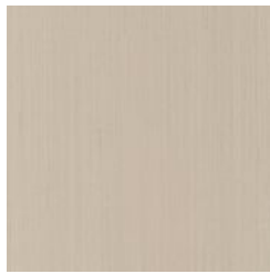
SN101061P MARBLE COLOR