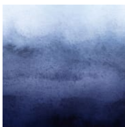
DEEP SEA OMBRE

Digital Print » Metallics, Textures and Timber