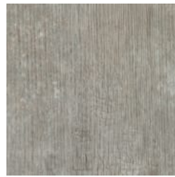
MARKET OAK GREY