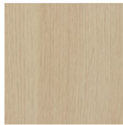
RIFT OAK NATURAL