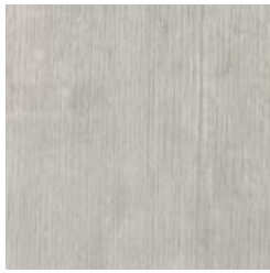
MARKET OAK WHITEWASHED