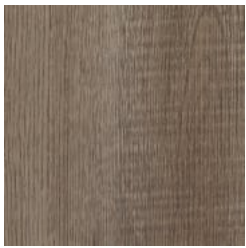
AGED BROWN OAK