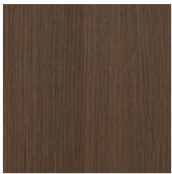
RIFT OAK BROWN