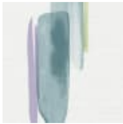
AZ53660 WELLNESS WHITE