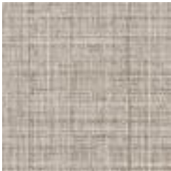
AZ53721 WOVEN WHEAT