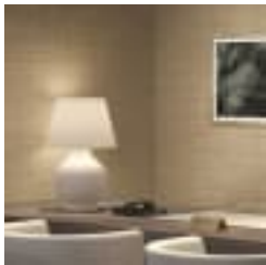
AZ53715 WHITE WILLOW