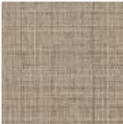
AZ53722 SAND DUNE