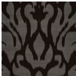
W2-SK-06 BLACK PEARL