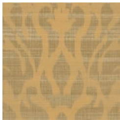
W2-SK-05 TOASTY MAPLE