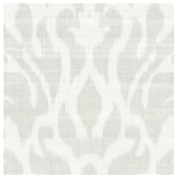
W2-SK-01 ETHEREAL WHITE