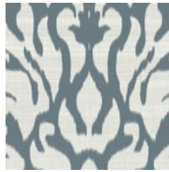
W2-SK-02 ETHEREAL STEEL