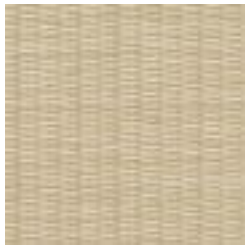
W2-WP-01 WHEAT FIELD