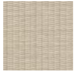
W2-WP-04 CANYON VIEW