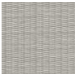
W2-WP-11 MORNING FOG