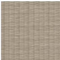
W2-WP-05 WATER REED