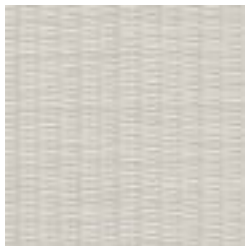
W2-WP-06 COTTON BREEZE