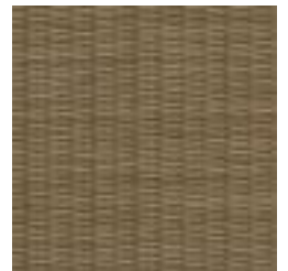
W2-WP-09 RAW UMBER