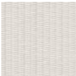
W2-WP-10 SILVER GRASS