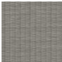
W2-WP-12 SLATE GREY