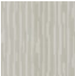
MRE1642 NATURAL WHITE