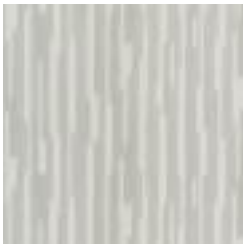
MRE1641 OPTIC WHITE