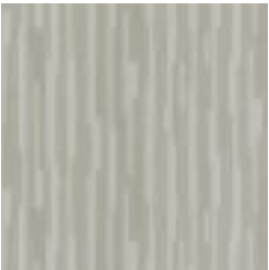
MRE1644 PEARL TRAX