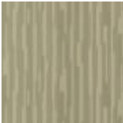
MRE1646 SUN DECK