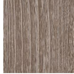
SG13-09 RATTAN MAPLE