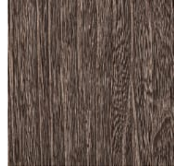
SG13-10 HERITAGE BROWN