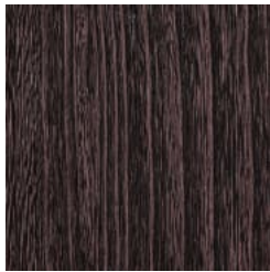
SG13-12 DARK CHERRY