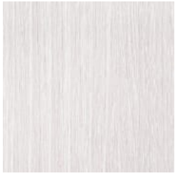
SG13-01 WHITE BIRCH

Wallcoverings » Commercial Wallcoverings