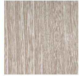
SG13-05 AGED OAK