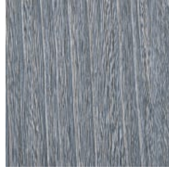
SG13-08 DRIFT BLUE