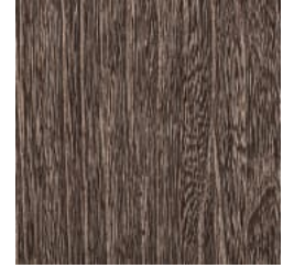
SG13-10 HERITAGE BROWN