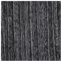
SG13-11 BLACK CERUSE