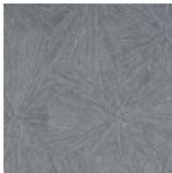
SG07-06 CARBON GREY