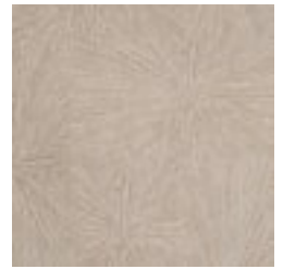
SG07-04 SOFT OAK