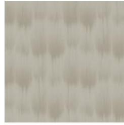
WD21-03 NEW DRIFT