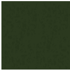
27 DARK OLIVE