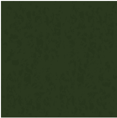
27 DARK OLIVE