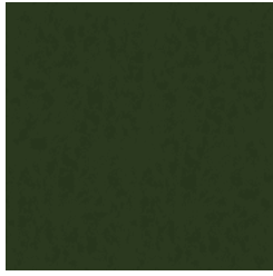
27 DARK OLIVE