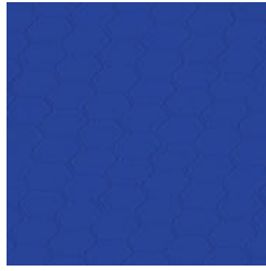
GEOQU3003 LAKE BLUE