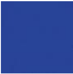
GEOQU3003 LAKE BLUE