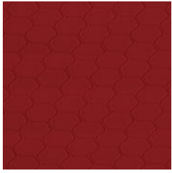
GEOQU17 DEEP SCARLET

Fabrics » Vinyl and Faux Leather Fabrics