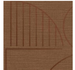
AZ53703 SAINT DOMINIC