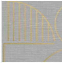
AZ53696 WILD BREEZES