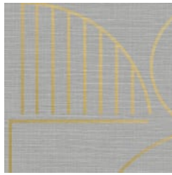
AZ53696 WILD BREEZES