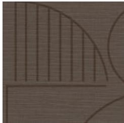
AZ53700 TRANSISTOR RADIO