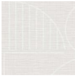
AZ53695 BEYOND PALE