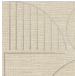
AZ53701 HAMPTONS BEIGE