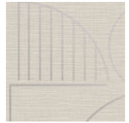
AZ53698 HALL OF FAME