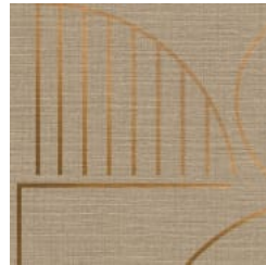
AZ53702 IRISH LINEN