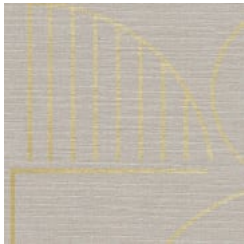
AZ53699 INTO THE MYSTIC