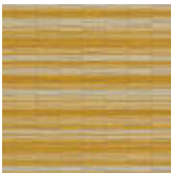
FRQ 21 TOPAZ