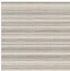
FRQ 20 IONIC