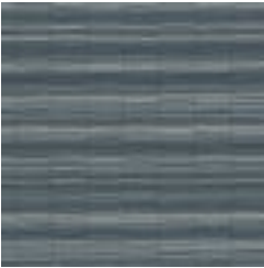
FRQ 29 NAUTICAL