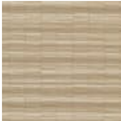
FRQ 25 GINGERSNAP