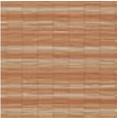
FRQ 24 COPPER