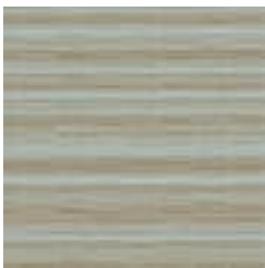
FRQ 23 SEASHORE