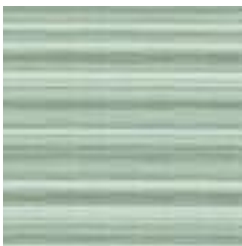
FRQ 22 CELADON