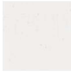
SPR1-03 WHITE HOUSE