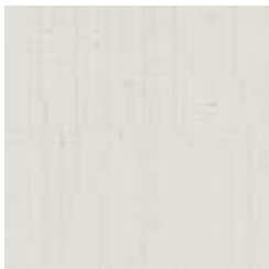
SPR1-15 TAJ MAHAL