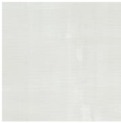
P3T 60335 BABYS BREATH

Wallcoverings » Advanced Wall Protection