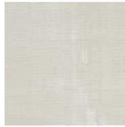
P3T 60338 WHITEWASH