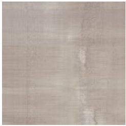
P3T 60340 SMOOTH SABLE