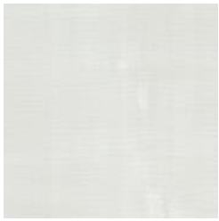
P3T 60335 BABYS BREATH

Wallcoverings » Advanced Wall Protection