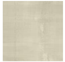
P3T 60339 CANVAS CLOTH