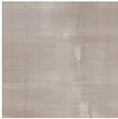
P3T 60340 SMOOTH SABLE