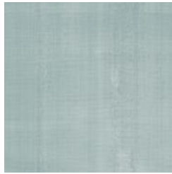
P3T 60342 SEA BREEZE