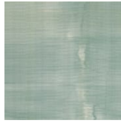
P3T 60343 SERENE GREEN