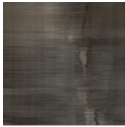
P3T 60337 GRAPHITE