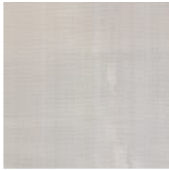
P3T 60341 WARM LAVENDER