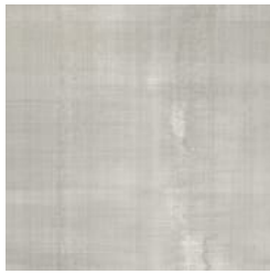
P3T 60336 SILVER POINT