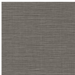
A205-852 CHELSEA GRAY