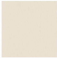
AFP02-015 White Gold