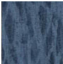
SG15-06 NIGHT LIFE