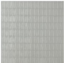
SG19-10 GRANITE GRAY