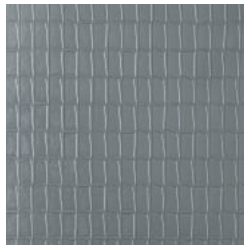
SG19-12 SLATE BLUE