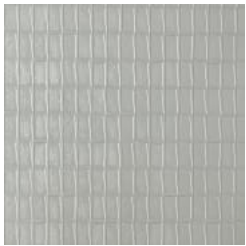
SG19-10 GRANITE GRAY