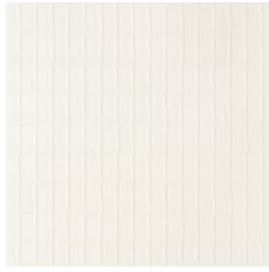
SG19--01 SILK WHITE