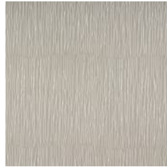
SG200-6 STONE WALL