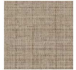
P3T-60374 SAND DUNE