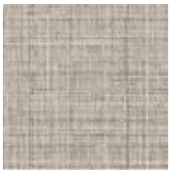
P3T-60375 WOVEN WHEAT