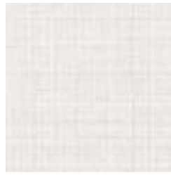
P3T-60367 WHITE WILLOW