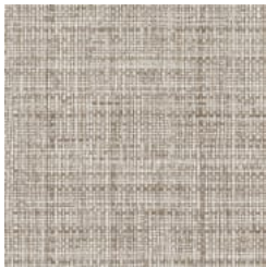
P3T-60375 WOVEN WHEAT