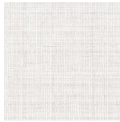
P3T-60367 WHITE WILLOW