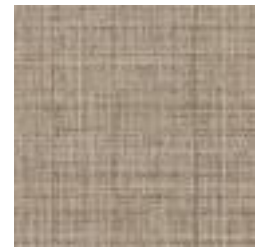
P3T-60374 SAND DUNE