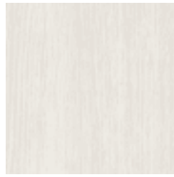
P3T-60387 WHITE WASH