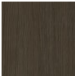
P3T-60391 BLACK WALNUT