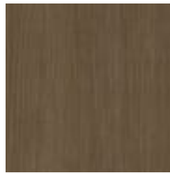
P3T-60392 AGED IROKO