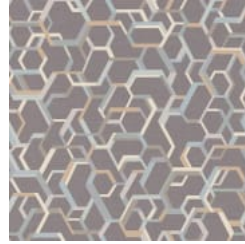
TKR 17 SLATE