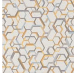
TKR 16 DUNE