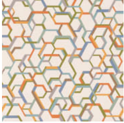
TKR 14 DOODLE