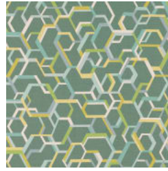
TKR 12 CRISP