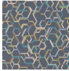
TKR 11 ATLANTIC