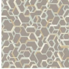
TKR 15 DOVE