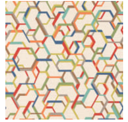
TKR 13 LINK