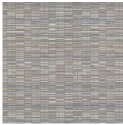
BNK 10 PEWTER