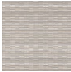
BNK 11 GHOST