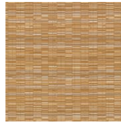
BNK 12 AMBER