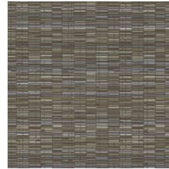
BNK 18 LOAM