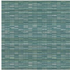
BNK 15 VIRIDIAN