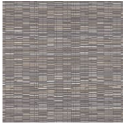
BNK 14 BASALT