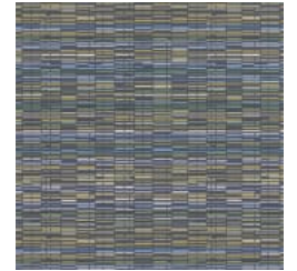
BNK 19 REGENT