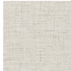
BB-TL-13 HORSE HAIR