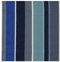
303 MOONLIT STROLL