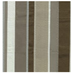
608 ENGLISH OAK