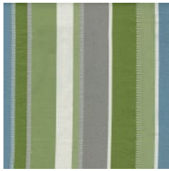
203 MORNING SKY