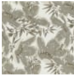
BEWIT 608 OAK