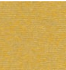
ACACI 502 SUNSHINE