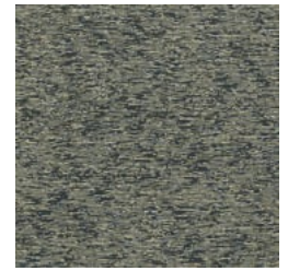
ACACI 99 STONE