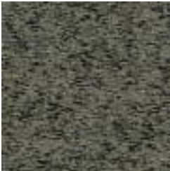
ACACI 909 MIDNIGHT