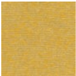
ACACI 502 SUNSHINE