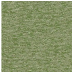
ACACI 21 FERN