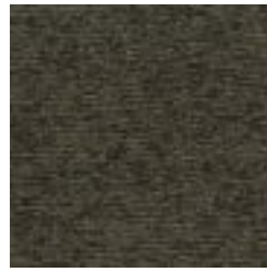
ACACI 81 OAK