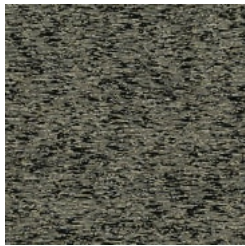
ACACI 909 MIDNIGHT