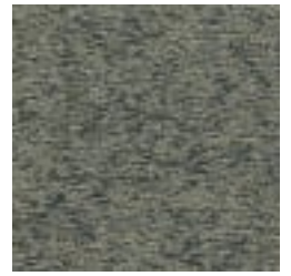
ACACI 99 STONE