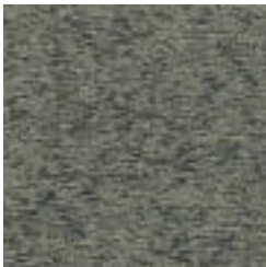
ACACI 99 STONE