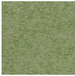
ACACI 21 FERN