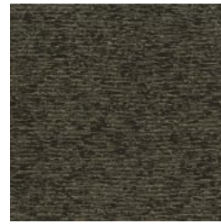
ACACI 81 OAK