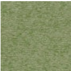
ACACI 21 FERN