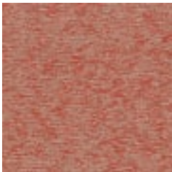
ACACI 44 SUNSET