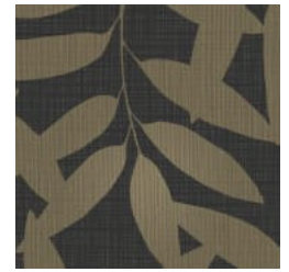
MIDNIGHT GLOW BB- WX-04