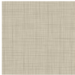
MUSHROOM BB- WW-12