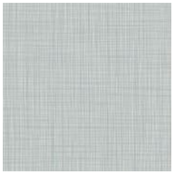
BLUE JAY BB-WW-15