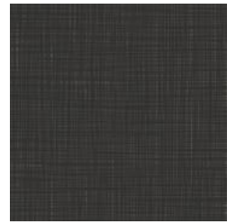
MIDNIGHT GLOW BB- WW-04