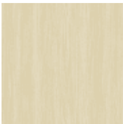
A212-122 SUGAR PINE