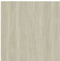
A212-831 WINTER BRANCH