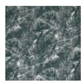
292 RACING GREEN