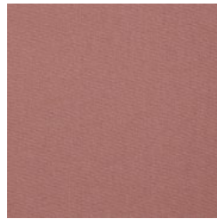
574 DARK CORAL