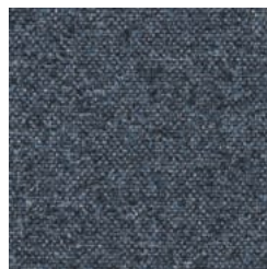
1011738 DEEP TEAL