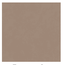
Terracotta Sun Bleached