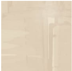
AZ53794 CHIFFON BLUSH