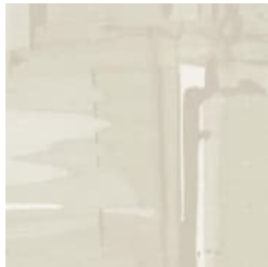
AZ53795 TOUCH OF GOLD