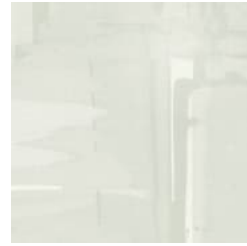
AZ53792 CAST GLASS