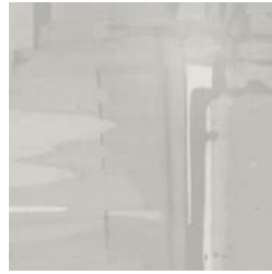
AZ53791 SOFT SHADOW