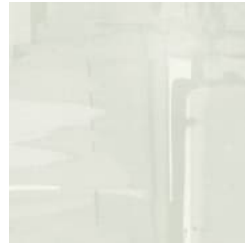
AZ53792 CAST GLASS