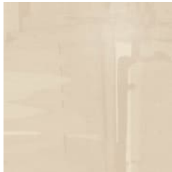
AZ53794 CHIFFON BLUSH