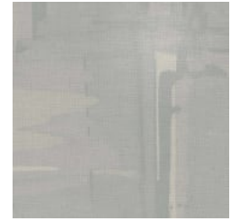
AZ53793 SWEDISH FOG