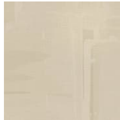
AZ53796 WARM LAYERS