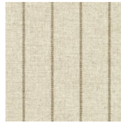
SI21-03 OATMEAL STRIPE