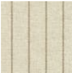
SI21-03 OATMEAL STRIPE