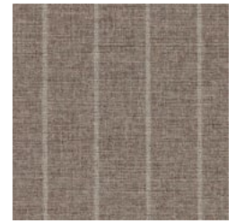
SI21-04 MOHAIR STRIPE