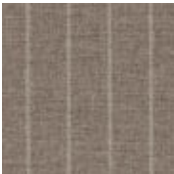
SI21-04 MOHAIR STRIPE