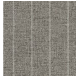
SI21-08 CASHMERE STRIPE