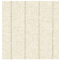
SI21-02 FLAXEN STRIPE