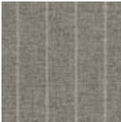
SI21-08 CASHMERE STRIPE