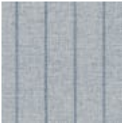
SI20-07 ANGORA STRIPE