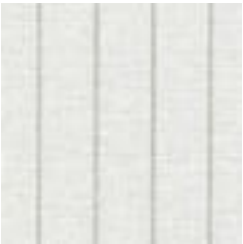
SI21-05 LINUM STRIPE