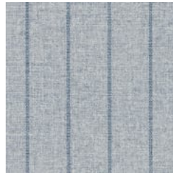
SI20-07 ANGORA STRIPE