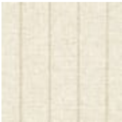
SI21-02 FLAXEN STRIPE