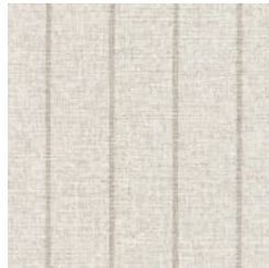
SI21-06 HOLLAND STRIPE