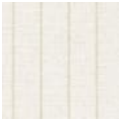
SI21-01 LOOM STRIPE