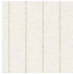
SI21-01 LOOM STRIPE