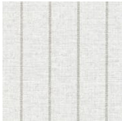
SI21-05 LINUM STRIPE