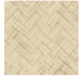
R321-04 NATURAL JUTE